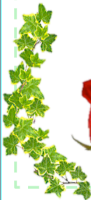
Red rose: I love you